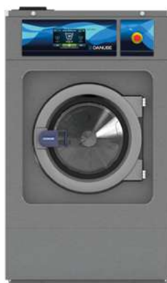
INDUSTRIAL WASHER HOT WATER (1.2kW) WED-18 ET2