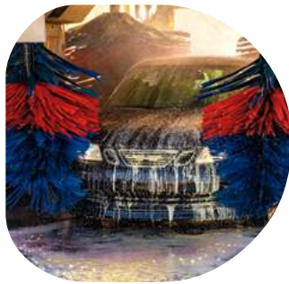
Car wash stations

It's an efficient, flexible solution for those who want full service in a minimum of space.