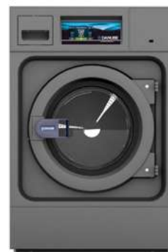
PROFESSIONAL WASHER HOT WATER (0.75kW) WPR-10 ET2