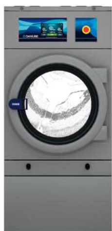
INDUSTRIAL DRYER ELECTRIC (12kW) DD-18 SILVER ET2

It comes as standard with 3 pre-configured machines for self-service use: an 18 kg industrial washer, an 10 kg professional washer and an 18 kg industrial dryer, all equipped with EASY TOUCH 2, ready to be connected, and also offers a number of optional accessories.