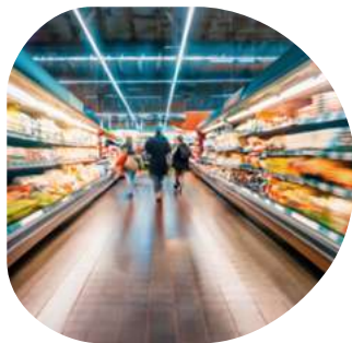
Hypermarkets / supermarkets