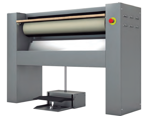
Commande manuelle par pédale Manual control by pedal